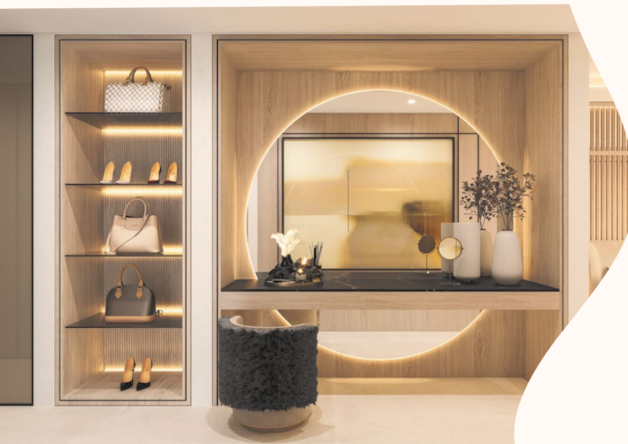
Warm & modern Texture & simplicity