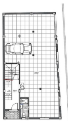
PLANTA BAJA DE 100,00 M 2