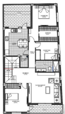
PLANTA ALTA DE 100,00 M 2